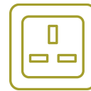
Electrical Hook Ups